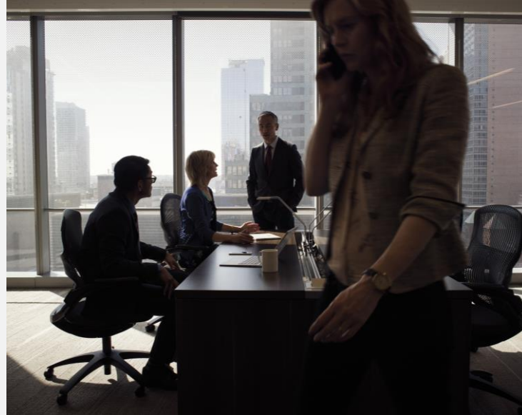
Hybrid AADJ vs AADJ